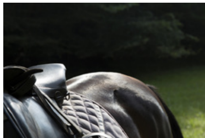
Horse riding among the vines