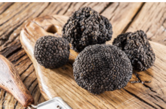
Truffle hunting & preparing