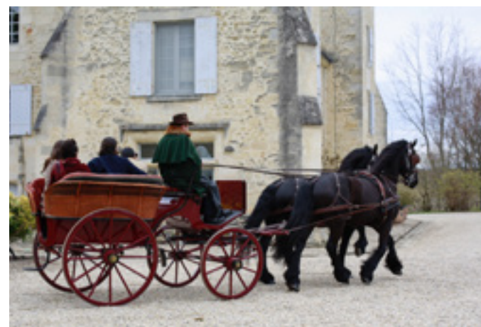
Carriage rides and lessons