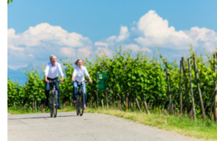
Exploring the region by bicycle