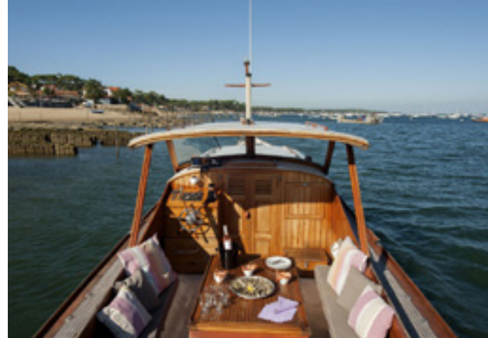
Boat trips in the Bay of Archachon