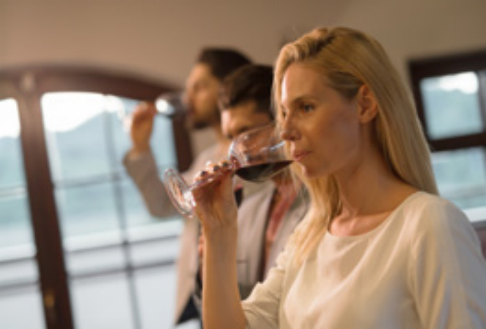
Wine tours and tasting