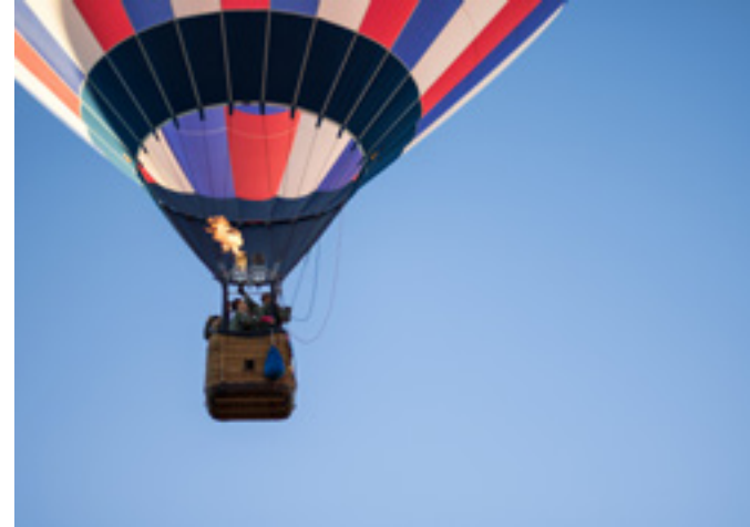
Hot Air Ballooning over Bordeaux countryside