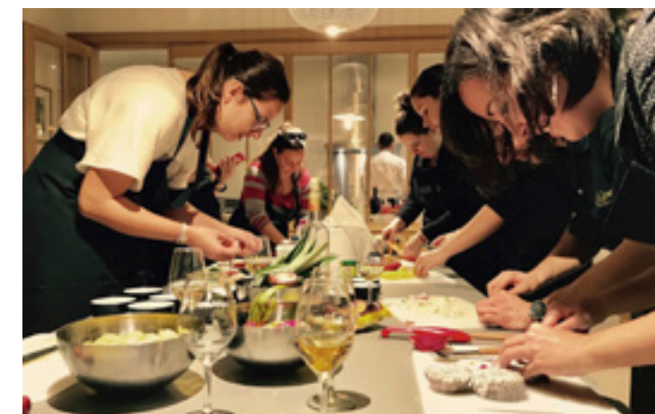
Cooking with world-class chefs